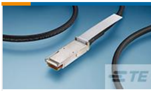
TE Part # 1-2220639-0 QSFP TO QSFP, ACTIVE, 28AWG, 10M