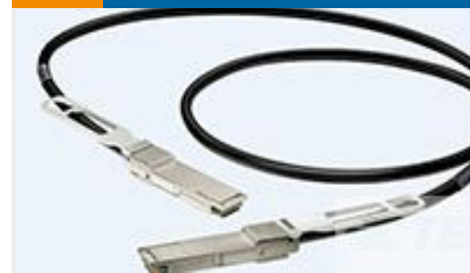
TE Part # 2829040-4 QSFP IB EDR, 30AWG, 1.0M