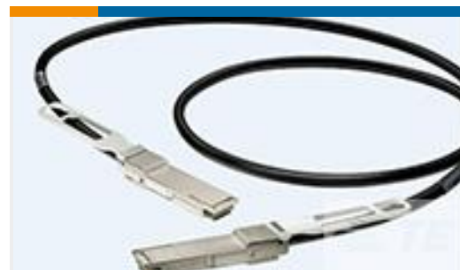
TE Part # 2829040-8 QSFP IB EDR, 26AWG, 3.0M