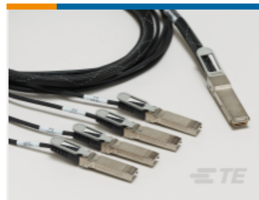
TE Part # 2821033-8 QSFP TO [4]SFP+, 28G, 1M, 33AWG