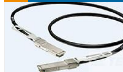
TE Part # 2829040-6 QSFP IB EDR, 30AWG, 2.0M