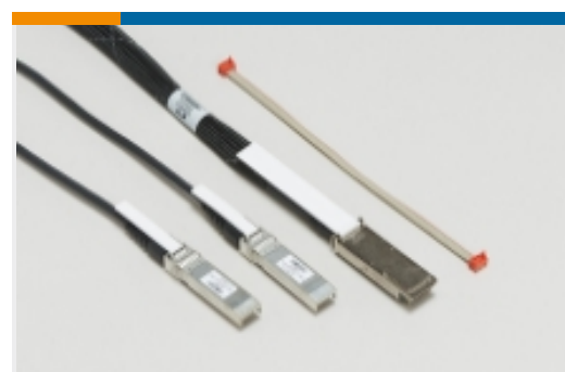
Pluggable I/O Cable Assemblies(33)