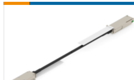
TE Part # 2053638-4 C/A, QSFP, 4M, P1-P2, UNEQUALIZED