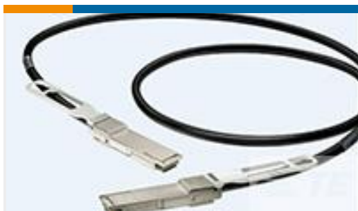
TE Part # 2829040-7 QSFP IB EDR, 26AWG, 2.0M