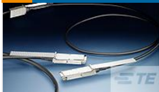
TE Part # 2202165-5 QSFP TO QSFP, 26AWG, FDR, 5.0 METER