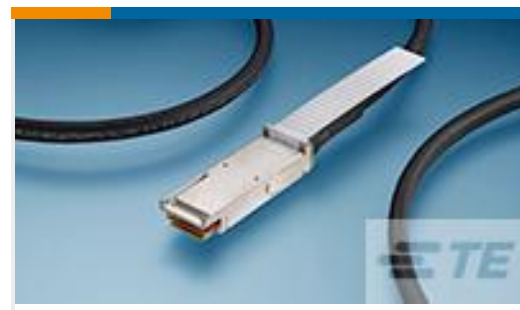
TE Part # 1-2220639-3 QSFP TO QSFP, ACTIVE, 28AWG, 13M