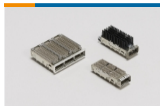
QSFP, QSFP+ & zQSFP+(168)