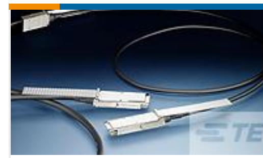
TE Part # 2202165-4 QSFP TO QSFP, 26AWG, FDR, 4.0 METER