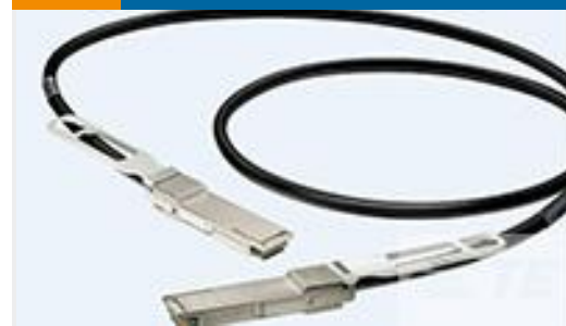
TE Part # 2829040-2 QSFP IB EDR, 33AWG, 1.0M